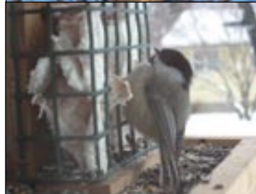
Species such as the Black-capped Chickadee (left) are waiting to be counted in the Back Yard Bird Count.

perhaps we will be fortunate to spot them during the Great Backyard Bird Count. Keep your eyes peeled and cameras handy. If you are unsure of a species, ask a friend for help, grab a bird guide, or use the available resources online at Pictures are an important back-up when those rare birds pop into our neighborhood like the American Goldfinch and Common Grackle visiting feeders last year.