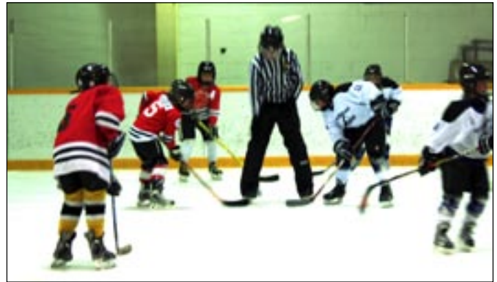
Pinawa Panther Atoms in action.