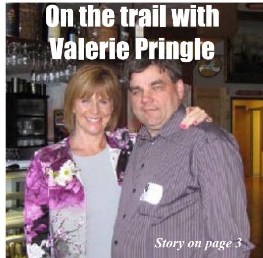
On the trail with Valerie Pringle